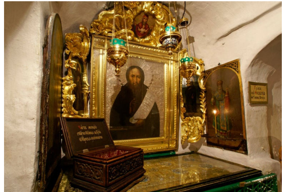
Relics of St. Theodosius in the Kiev Caves Lavra.

4 th Sunday of Pascha: Paralytic Ven Theodosius, Abbot of Kiev Caves Lavra