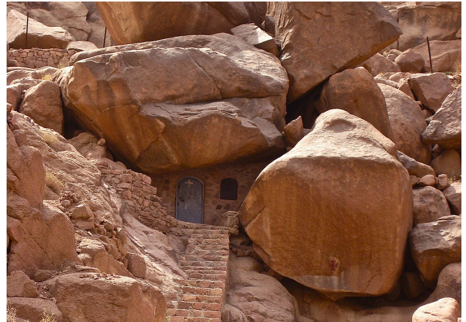
Cave of St. John Climacus in Sinai